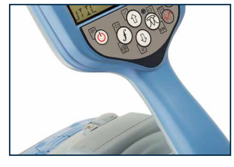
Li-lon battery pack

Lithium-Ion rechargeable battery options for both locator and transmitter provide extended runtime with reduced running costs.