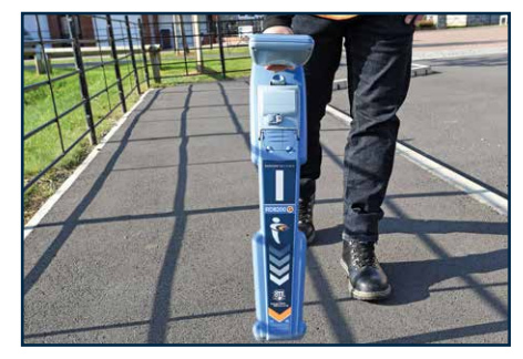
Swing Warning System Alerts the operator of excessive side to side movements, driving correct RD8200 usage.