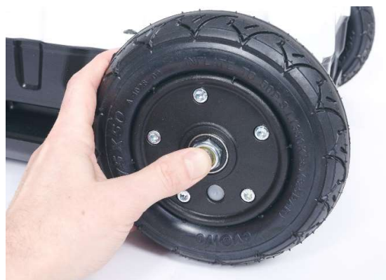
Press the quick release pin and pull the wheel to remove.

See RTC Mini Quick guide for more information.