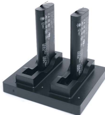
External dual battery charger

The batteries are charged in an external RRC charger., both batteries can be charged at the same time.