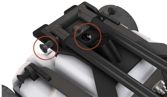
Press the button and pull the quick lock knob to unfold the handle. Secure the silver-coloured knob when in up-right position.

Fit the two handle parts to each other and, when in upright position, secure the silver-colored knob on the mid part