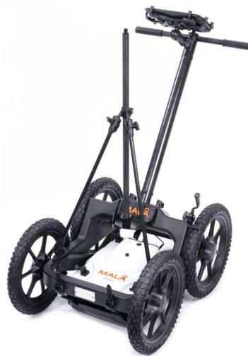
RTC Mini with optional GPS/Prism attachment

The RTC Mini is an off-road rough terrain cart that enables the use of the Easy Locator Core in areas of uneven terrain.