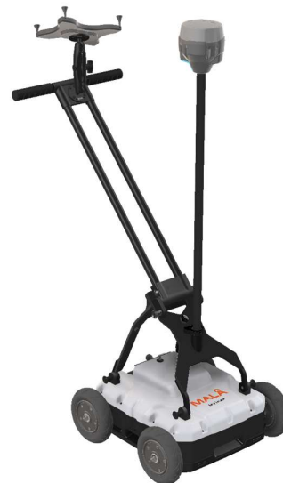
The tablet is attached to the tablet holder on the top part of the handle. The GNSS device or Total Stations prisms (on top of an extension pole) is attached to the GNSS bracket with a quick release mechanism.

The rear left wheel has an internal encoder for data triggering and precise distance measurements.