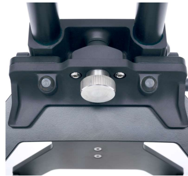
The silver-colored knob used to secure the two handle parts.

Attach a tablet for data acquisition (and if needed an external GNSS device or a Total Station prism).